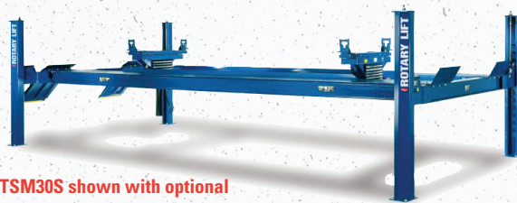
ROTSM30S shown with optional ROTRJ150 rolling jacks

3 easy monthly installments with No Interest!* Third Party Financing also available, contact MSE for details